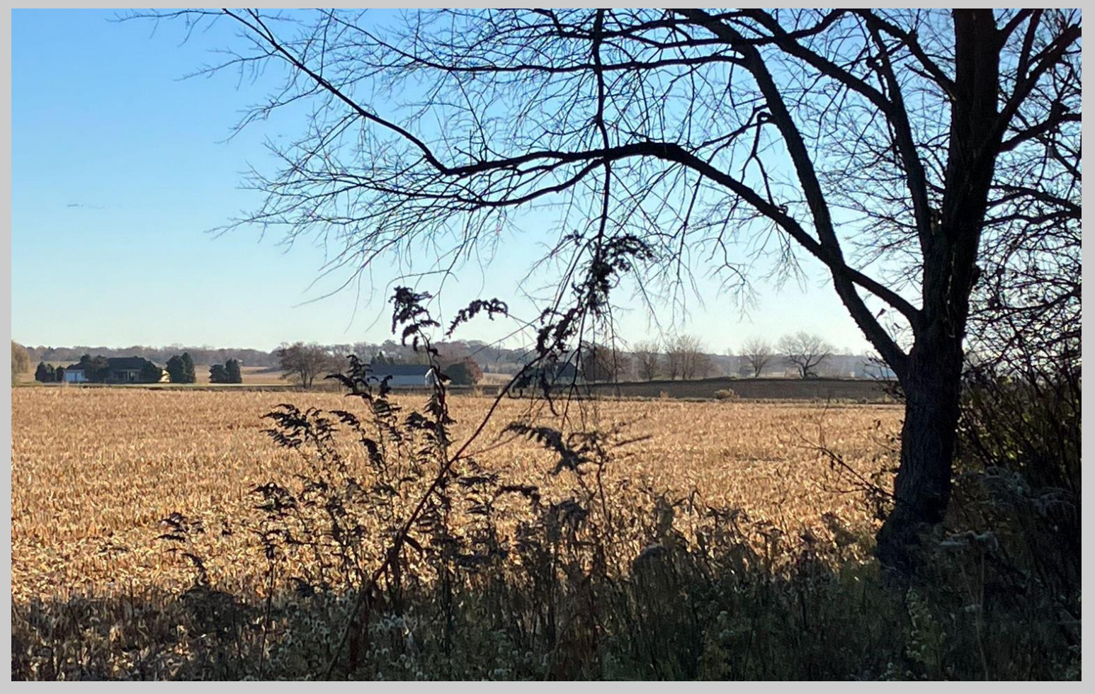
View from Pine Tree Subdivision - ENE